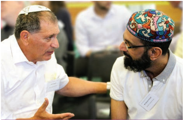
‘Dialogue on the Spot’ at IFN National Meeting