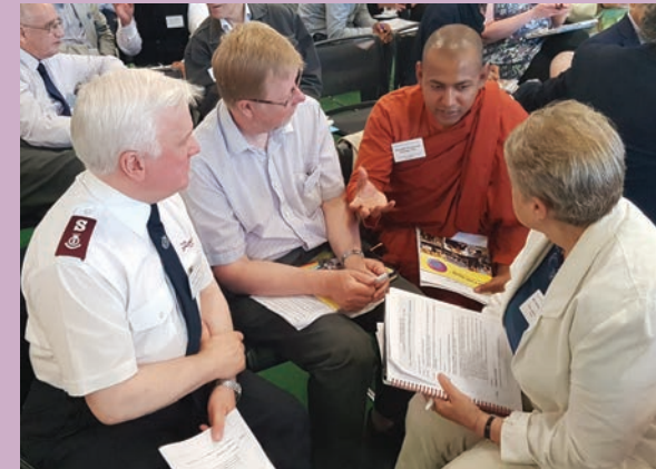
Discussion at IFN National Meeting