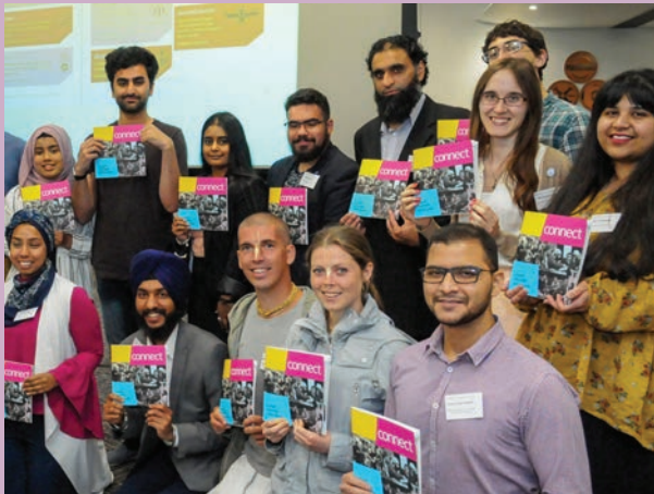
Launch of Connect youth inter faith action guide at IFN National Meeting