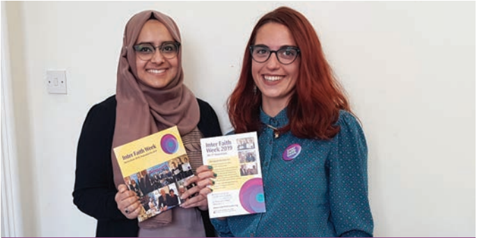
IFN Inter Faith Week interns